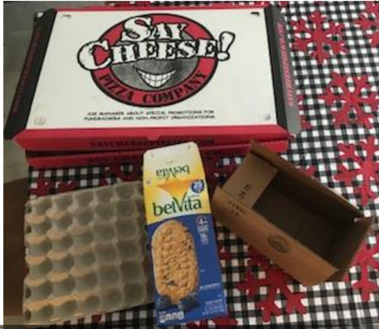
Some cardboard waste

Whenever we buy things online (from online stores such as Target, Amazon, or Ebay) the items come in boxes. Food items such as noodles, meat, breakfast food, and rice all come in cardboard boxes as well. Many items we buy from the store also come in boxes, such as toys, clothing, holiday decorations, iPhones, and electronics.