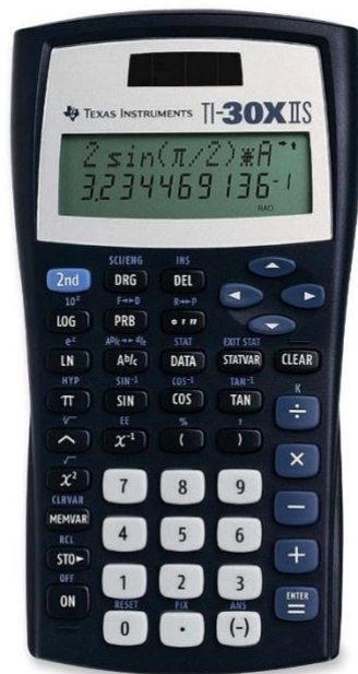
Image of TI- 30X IIS Scientific Calculator